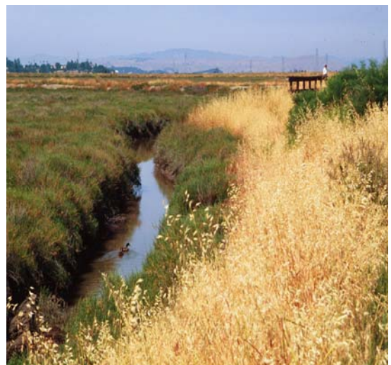
Marshland near Santa Margarita Island Preserve