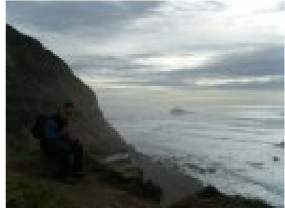
Coastline near Alamere Falls

The mixed forests of this Novato preserve usually host an amazing array of mushrooms at this time of year. With luck we'll make it to the top where we'll enjoy spectacular views in every direction (Distance: 6.5 miles; elevation gain: 1,300 feet). This walk is for adults. We request that no animals (except service animals) attend. David Herlocker will lead. Questions: Contact David at (415) 893-9508 or dherlocker@marincounty.org. Heavy rain may cancel. Call (415) 893-9527 on the morning of the walk to hear a recorded message if cancelled. Meet at the Vineyard Road gate, just past the end of the pavement. Directions: In Novato, follow Sutro Avenue and turn right at Vineyard Road.