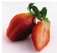
Catch the Wellness Spirit! Marin Wellness Collaborative

Funded in part by the US Department of Agriculture Food Stamp Program, an equal opportunity provider and employer, through the Network for a Healthy California. For information about the California Food Stamp Program, please call 415.473.3470.